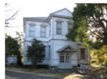
The old ward still remains.

This little historical anecdote may remind you of how pleasant the Chigasaki air is to live in.