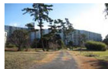
The Taiyo-no-Sato building. There are 190 rooms in it.