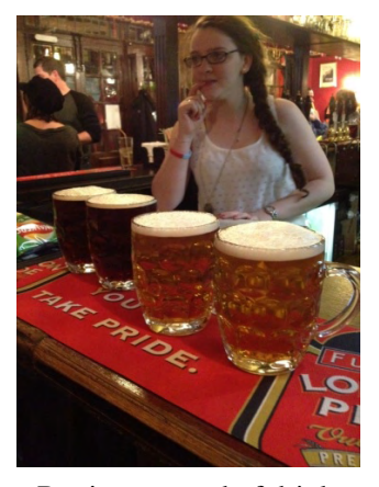
Buying a round of drinks