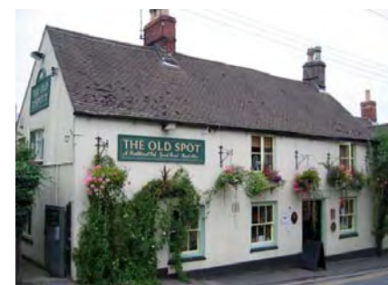
A country pub