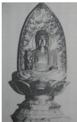
Shaka Nyorai (Buddha) 32cm + 20cm pedestal

Finally, in the graveyard lies the resting place of popular boxer Tsuneo Horiguchi (1914-1950) nicknamed “Piston Horiguchi” for the piston-like way his fists kept hammering his opponents without any regard for defense, which was said to exemplify the spirit of Japanese boxing in those days.