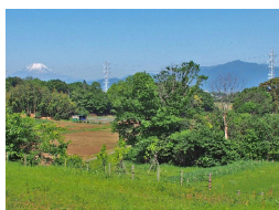
Yanagiyato in Satoyama Park