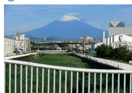
Toriido bridge/Ishihara bridge in Nango

The forests, trees, and other things that symbolize the city around town and that make up the landscape that represents Chigasaki are designated "Chigasaki landscape resources" and preserved.